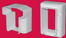
Straight Railing Brackets